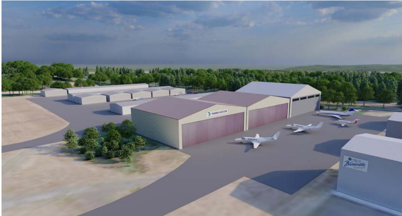
PORT OF BREMERTON SOUTH HANGER DEVELOPMENT