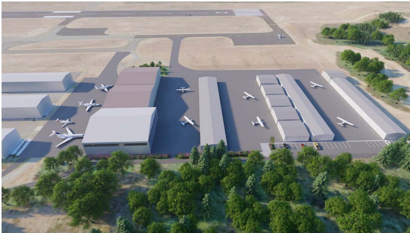
PORT OF BREMERTON SOUTH HANGER DEVELOPMENT